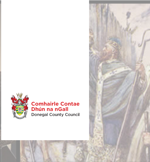
Above: The Song House Ireland - poetry workshops planned for Colmcille 1500