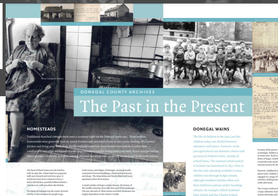
Left: Excerpt from 'The Past in the Present' exhibition.

The surviving archives of Donegal Grand Jury, dating back to 1753, have been digitised and will form part of the recreated archival 'Treasury.' The project includes a conference commemorating the centenary of the May 1921 Custom House fire and a publication. For more on this amazing project, see here .