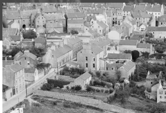
Left: Aerial View of the Mall, Ballyshannon.

National Heritage Week takes place from 14th - 22nd August 2021. This year's theme is 'Heritage for Everyone / Inclusive Heritage'. If you want to take part in Heritage Week, more information is available at: www.heritageweek.ie