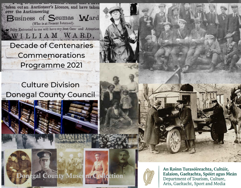
Left: Decade of Centenaries Commemorations Programme Culture Division, Donegal.